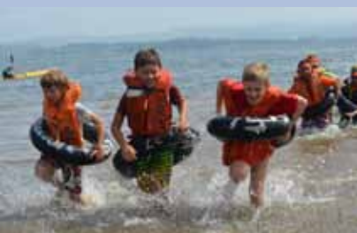
Cubs race to cross the finish line.

A wonderful weekend of Scouting fellowship allowing time for Scouts, adult leaders and families from all over KZN to interact and have fun.